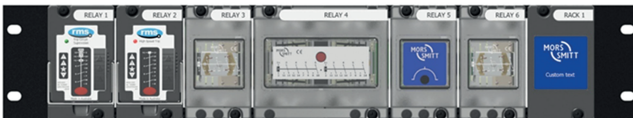
Figure 1: Example of a fully populated Delta-flex sub-rack